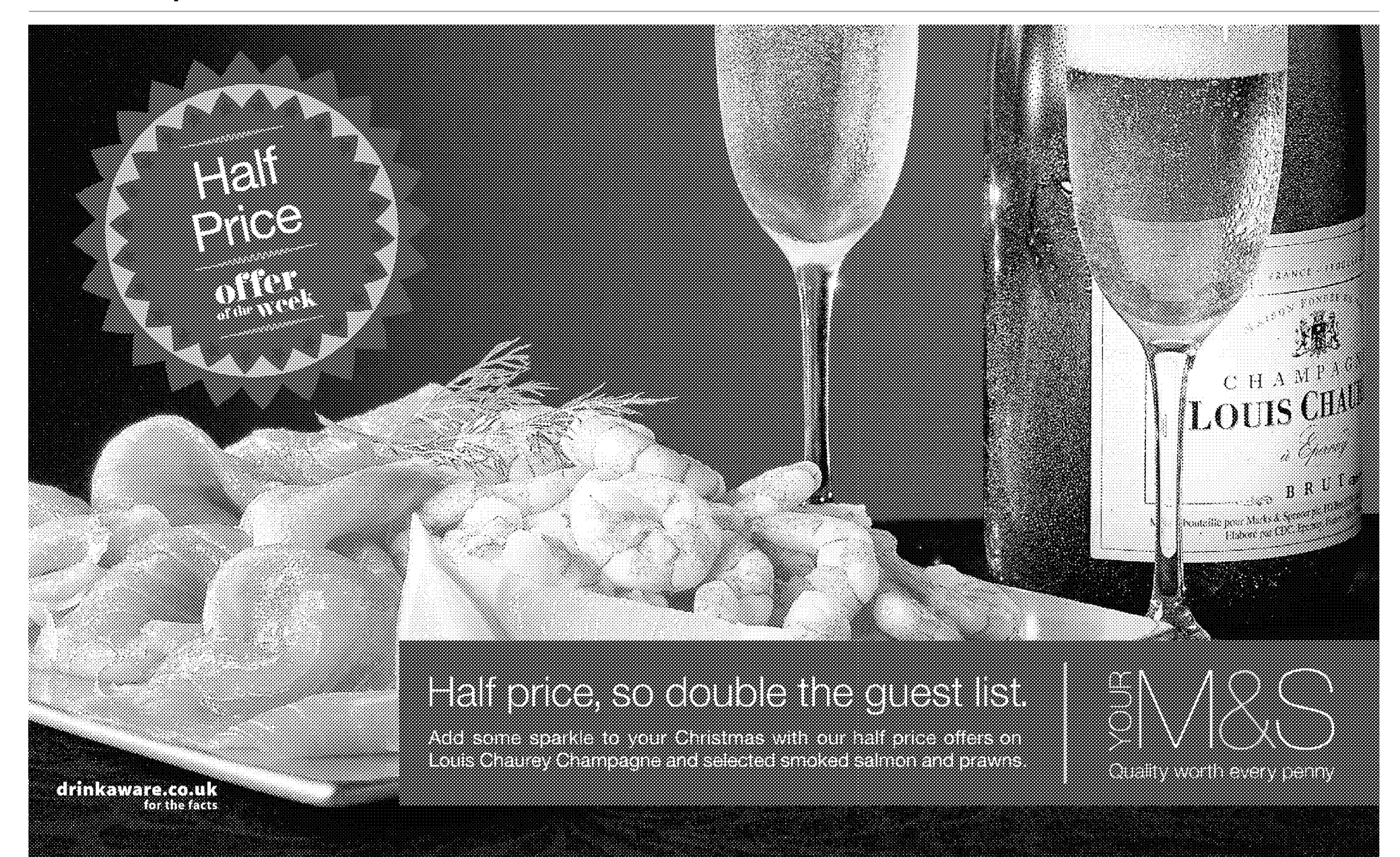
Selected UK stores only. See in store for details. Subject to availability. Prices may vary in selected stores. Champagne offer began 6th December 2010. Smoked salmon and prawn offer began 12th December 2010. These offers end 1st January 2011. Over 18s only. Please drink responsibly. Serving suggestion only. © Marks and Spencer plc.

the trust press office for the costs bill for Mr Delgado, the communications manger sent through 12 pages of invoices relating to Mr Delgado's claims for mileage, taxis and subsistence expenses within Northern Ireland – but with no reference to overseas trips.