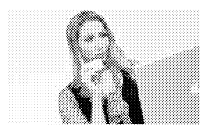
Scores of websites are selling stolen credit card details

\label{thm:copyright} \begin{tabular}{ll} Copyright material. This may only be copied under the terms of a Newspaper Licensing Agency agreement or with written publisher permission. \end{tabular}